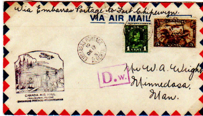
Cover #20 - From the collection of Murray Heifetz.

First Flight Cover from Embarras Portage to Fort Chipewyan. Postmarked EMBARRAS PORTAGE DE 17 31 Addressed to Minnedosa, Manitoba. Backstamped MINNEDOSA January 1 st 1932.